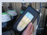
GFM416 Biogas analyser