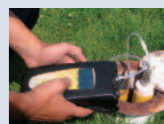
GFM600 Pressure and flow