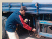
GFM200 Stowaway detection