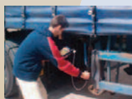
GFM200 Stowaway detection