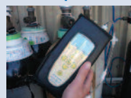
GFM416 Biogas analyser