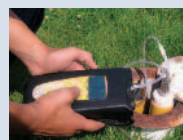
GFM600 Pressure and flow