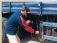
GFM200 Stowaway detection