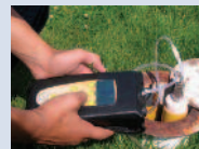
GFM600 Pressure and flow