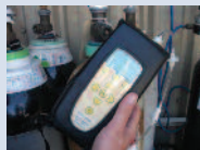
GFM416 Biogas analyser