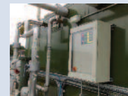
Click! System Fixed site monitoring